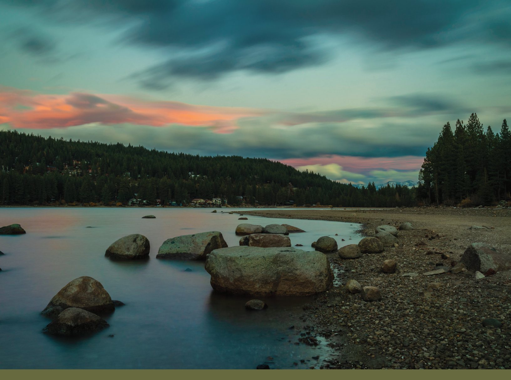
Exceptional service, local knowledge, boutique experience.